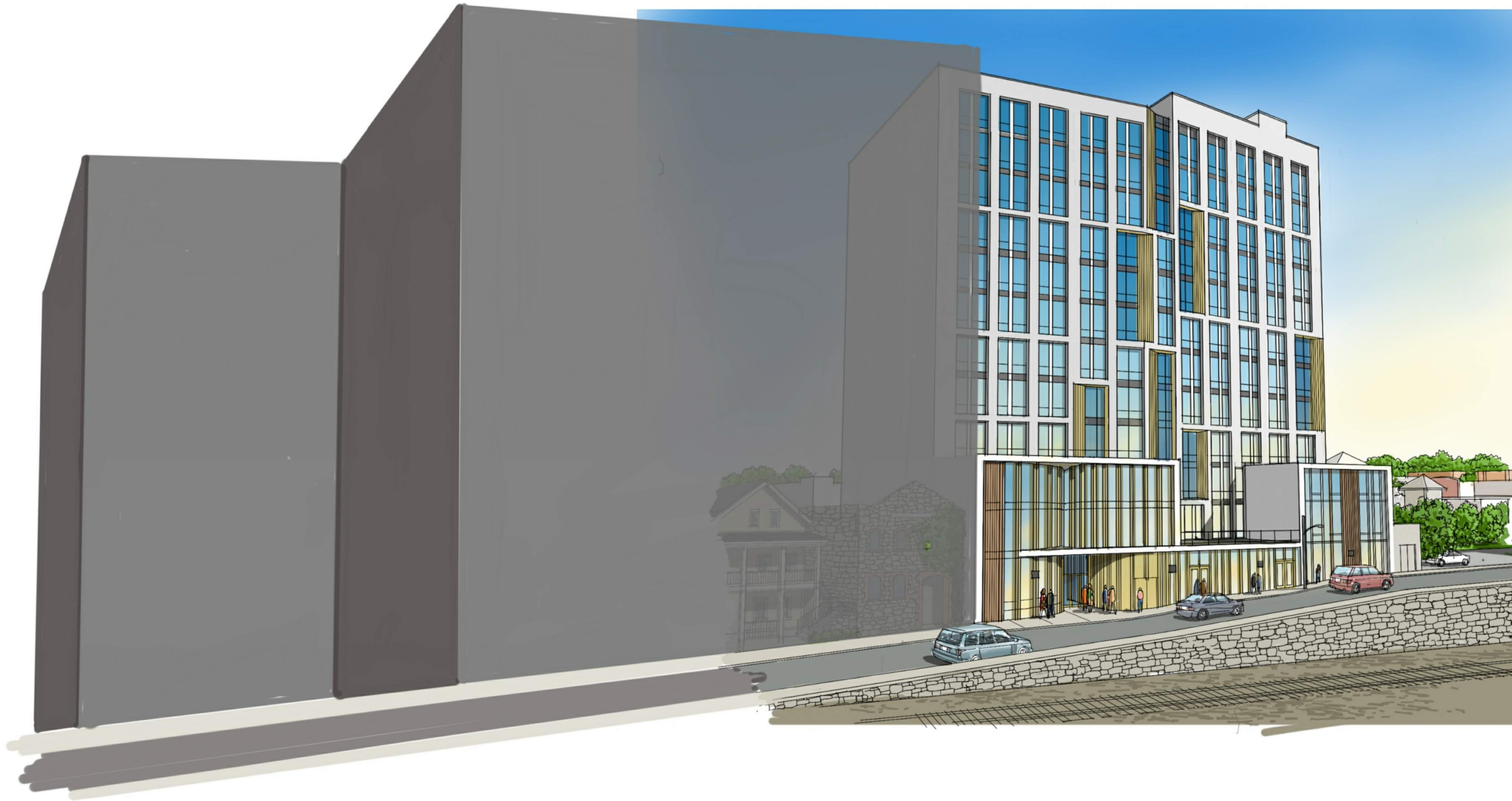
1 EAST BROADWAY - PERSPECTIVE SCALE: N.T.S.